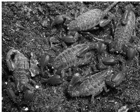
Fig. 1. Chaerilus philippinus . Males and females in a common terrarium.

The scorpions were reared by standard methods in plastic terraria of different sizes (Fig. 1). These contained a layer of soil, 2–3 cm in depth, as well as a few pieces of bark and a small Petri dish containing wa-