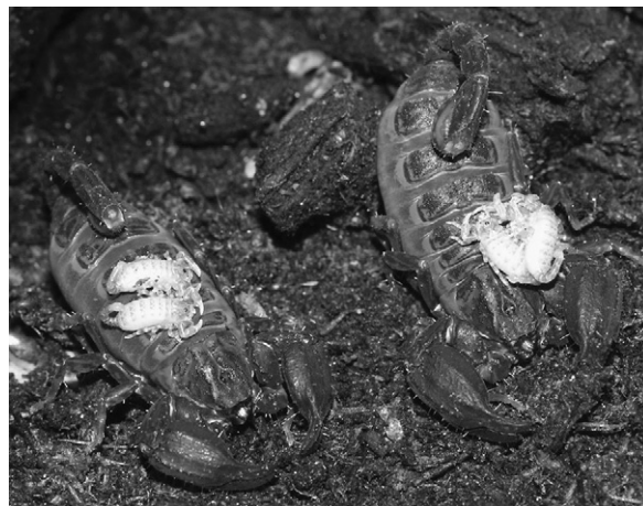
Fig. 2. Chaerilus philippinus . Females with offspring. Two females, in common terrarium, with pre-juveniles (instar I), during simultaneous birth process.

The theoretical morphometric growth factor for arthropods, as defined by Dyar [12] and Przibransky and Megusar [13] is 1.26. Growth parameters based on morphometric values, measured both on dead individuals and on exuvia, are shown in Table 1 and Fig. 4. The re-