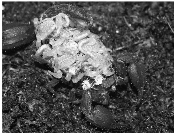
Fig. 3. Chaerilus philippinus . Female with offspring. Juveniles (Instars II) just after the first moult.

sults obtained for morphometric growth values of the different instars in C. philippinus are very similar to the standard theoretical values, but smaller than those obtained for most other species of scorpions [2,8,11,14].