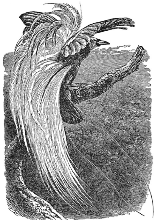
Fig. 2. The paradise bird Paradisaea papuana , after Darwin's Descent of Man and Selection in Relation to Sex . Darwin assumes that male ornaments in dimorphic species were selected by females, in the same way as breeders select "fancy" varieties in domestic species. Fisher will later suggest that these ornaments were originally linked to some selectively advantageous trait, then became extravagant due to a "runaway process".

The following fact is revealing. Between the first and the second edition of the Descent , Darwin's point of view evolved from a firm opinion which was relatively close to Fisher's one, to a doubtful opinion which seems further away from that of modern biology.