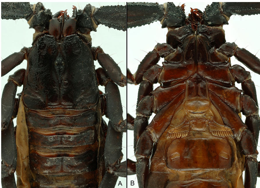
Fig. 2. Alloscorpiops ( Laoscorpiops ) calmonti sp. n. Female holotype. A. Carapace and chelicerae. B. Ventral aspect, showing coxapophysis, sternum, genital operculum and pectines.

Morphometric values (in mm) of female holotype. Total length (including telson) 72.1. Carapace: length 11.4; anterior width 6.9; posterior width 11.8.