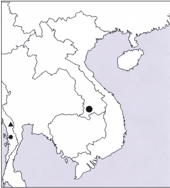
Fig. 1. Map showing known distribution of the genus Alloscorpiops : Alloscorpiops (A.) anthracinus (black asterisk), Alloscorpiops (A.) lindstroemii (black triangle) and Alloscorpiops (L.) calmonti sp. n. (black circle).

red. Legs blackish-brown. Venter and sternites reddish-brown; genital operculum and pectines reddish-yellow.