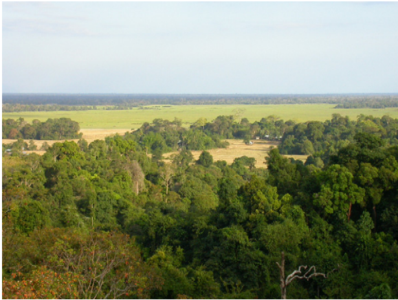
Fig. 4. Natural habitat of the new species in the region of Ban Kiet Ngong, southern Laos.