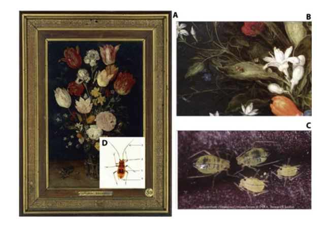
Bouquet of flowers in a vase, by Jan Brueghel the Elder Fig. 1 (1608, oil on copper 65 \times 45 cm); original (A) in the Pinacoteca Ambrosiana (Milan, Italy), © with permission. Detail with an aphid on a lily leaf (B) situated at the bottom-left corner of the bouquet. Inferred species, with the help of Dr C. Favret: Neomyzus circumflexus, quoted from Encyclop'aphid (C) with its typical darkish crescent on the back (D).

on three occasions and with the help of the G-art Gigapixel project, apart from Fig. 1: in another still life by velvet Brueghel, Flowers in a Vase displaying at the Antwerp museum of fine arts, and in a third Chat renversant un vase de fleurs by Abraham Mignon, Museum of Fine Arts, Lyon.