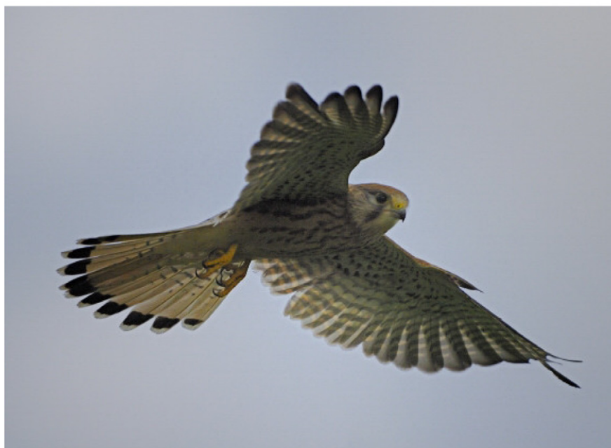
Fig. 1. Common Kestrel ( Falco tinnunculus ).

Feathers: the evolution of a natural miracle (2011)